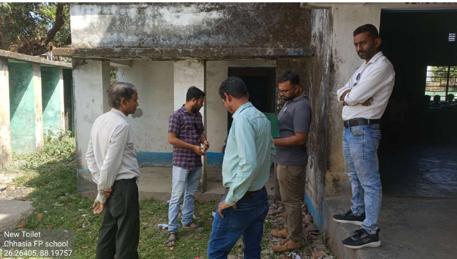
New Toilet Chhasia FP school 26.26405, 88.19757