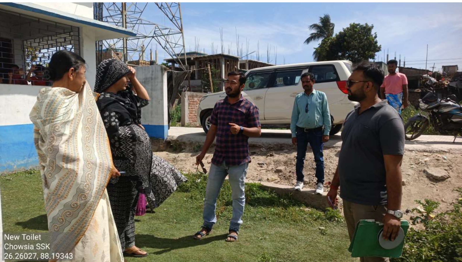
New Toilet Chowsia SSK 26.26027, 88.19343