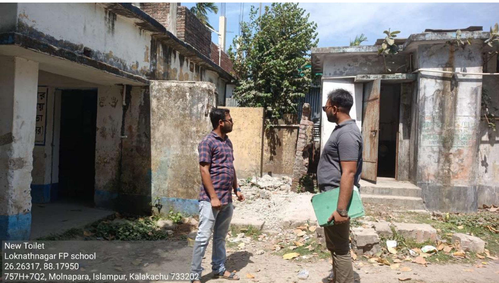
New Toilet Loknathnagar FP school 26.26317, 88.17950 757H+7Q2, Molnapara, Islampur, Kalakachu 733202