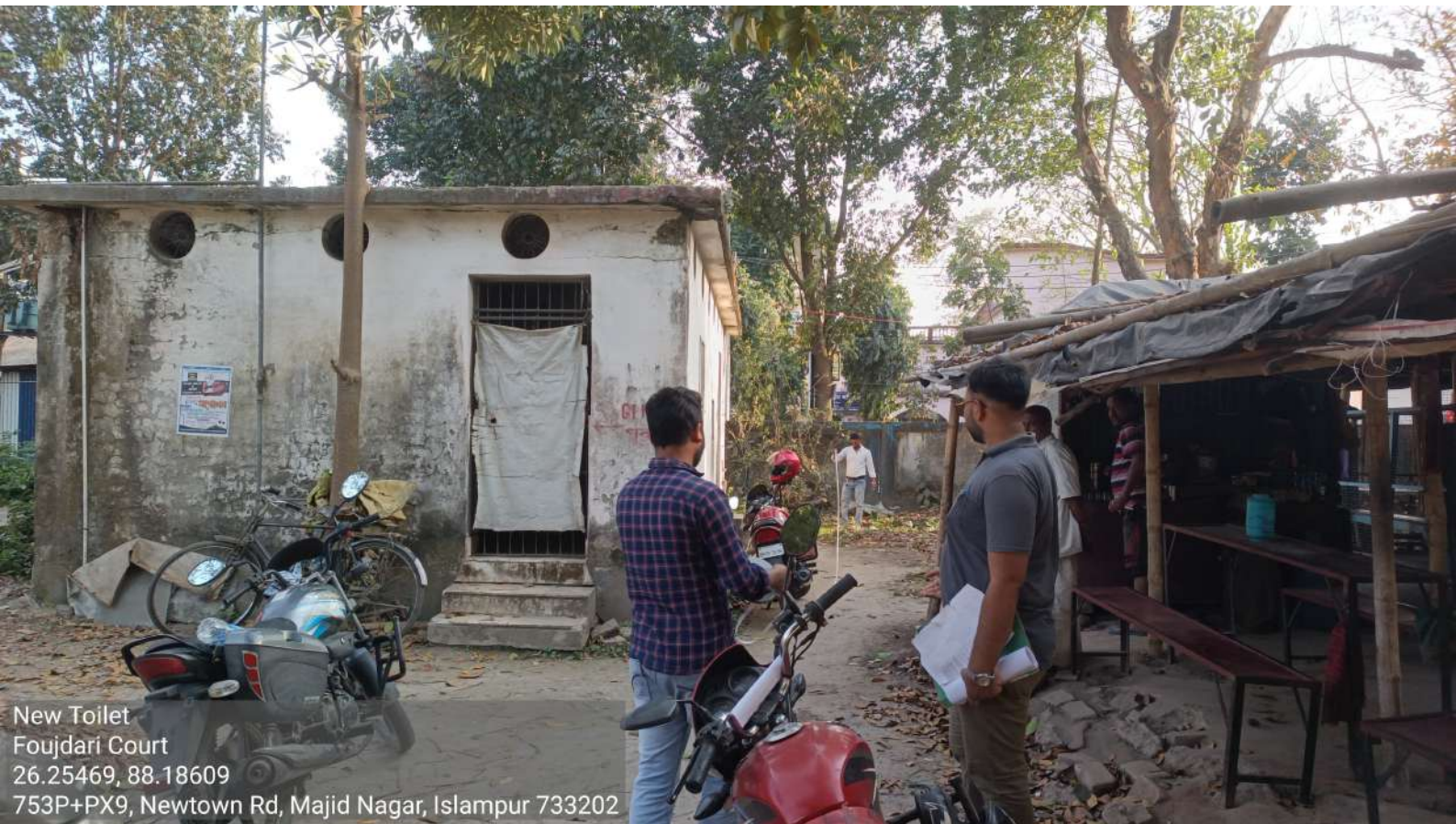
New Toilet Foujdari Court 26.25469, 88.18609 753P+PX9, Newtown Rd, Majid Nagar, Islampur 733202