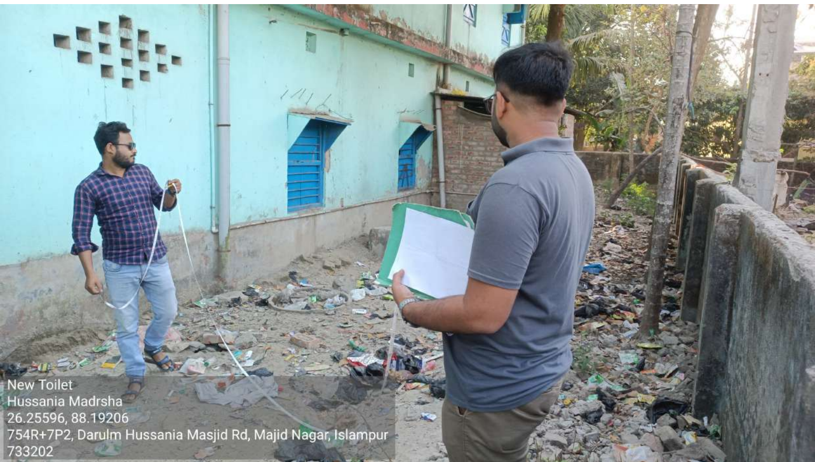
New Toilet Hussania Madrsha 26.25596, 88.19206 754R+7P2, Darulm Hussania Masjid Rd, Majid Nagar, Islampur 733202