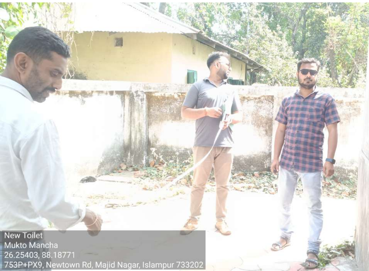
New Toilet Mukto Mancha 26.25403, 88.18771 753P+PX9, Newtown Rd, Majid Nagar, Islampur 733202