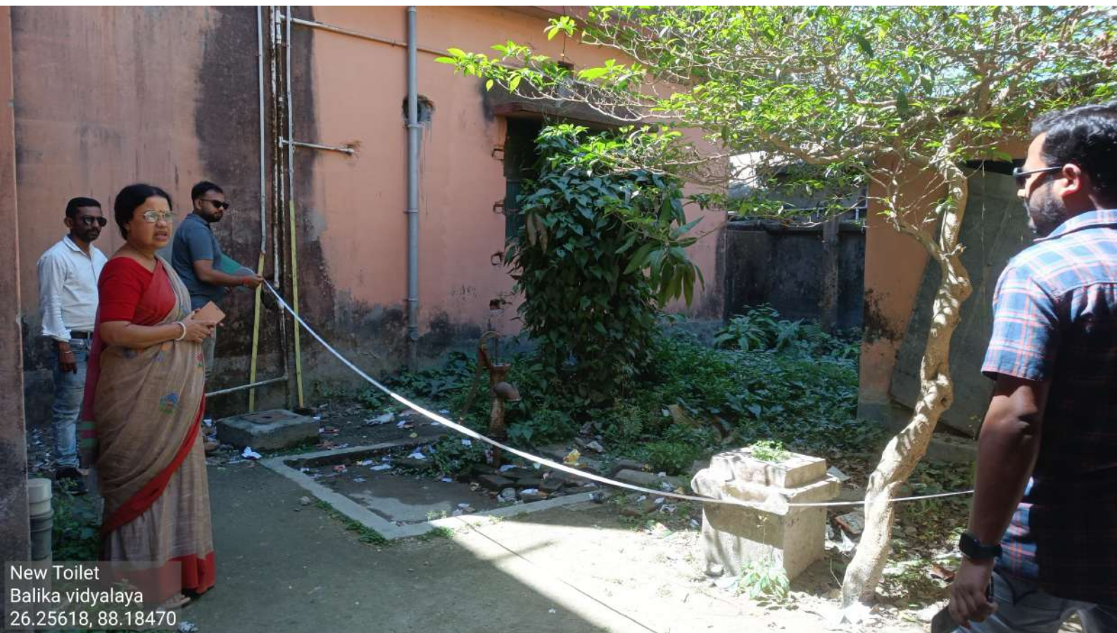
New Toilet Balika vidyalaya 26.25618, 88.18470