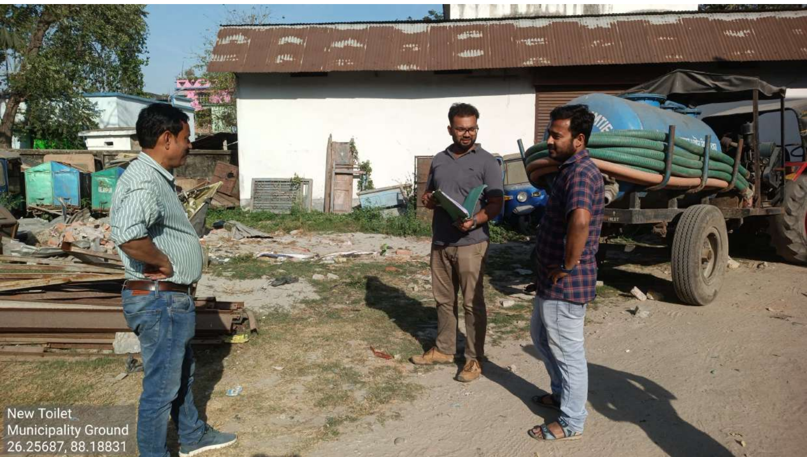
New Toilet Municipality Ground 26.25687, 88.18831