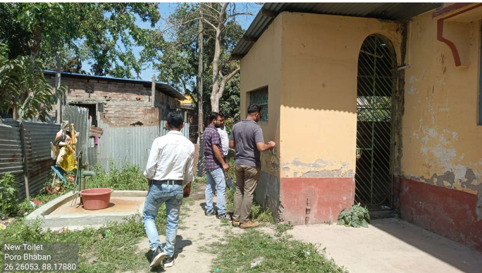
New Toilet Poro Bhaban 26.26053, 88.17880