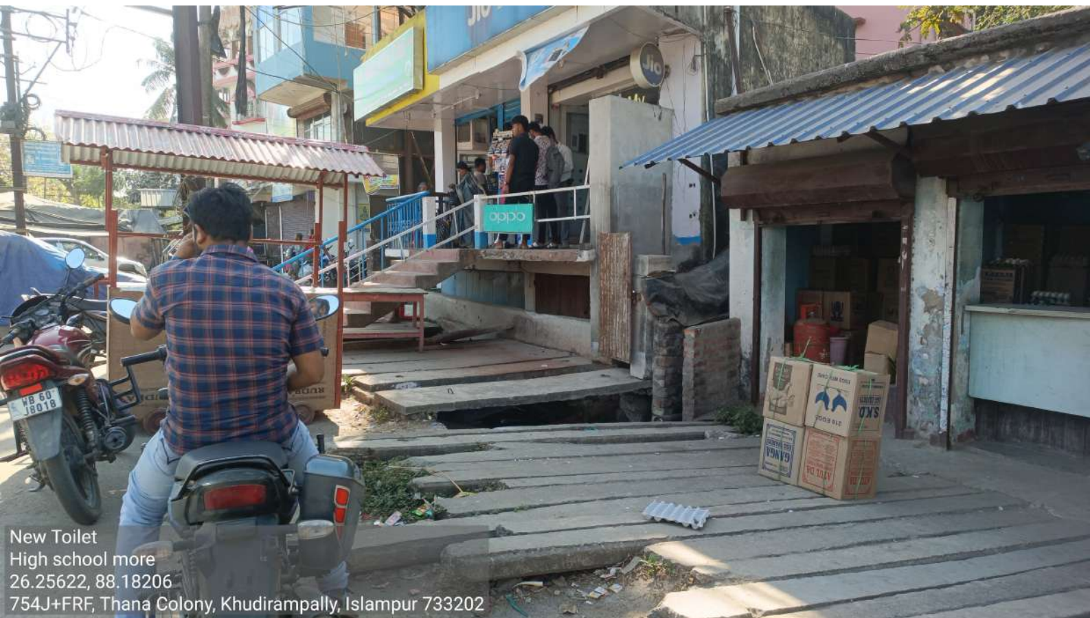
New Toilet High school more 26.25622, 88.18206 754J+FRF, Thana Colony, Khudirampally, Islampur 733202