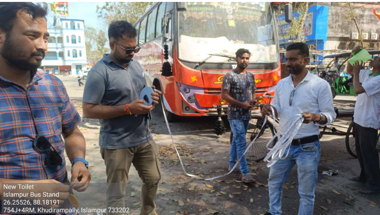
New Toilet Islampur Bus Stand 26.25526, 88.18191 754J+4RM, Khudirampally, Islampur 733202