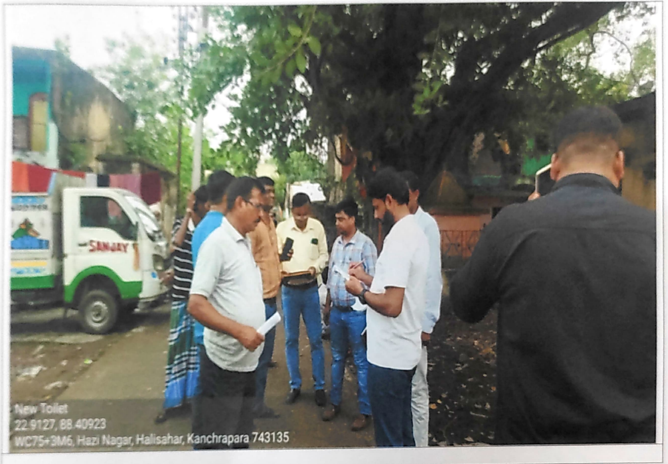
MANBHAWTI PRIMARY VALIKA VIDYALAYA