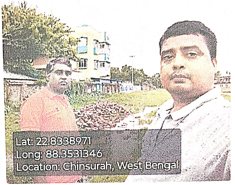
Lat: 22.8338971 Long: 88.3531346 Location: Chinsurah, West Bengal