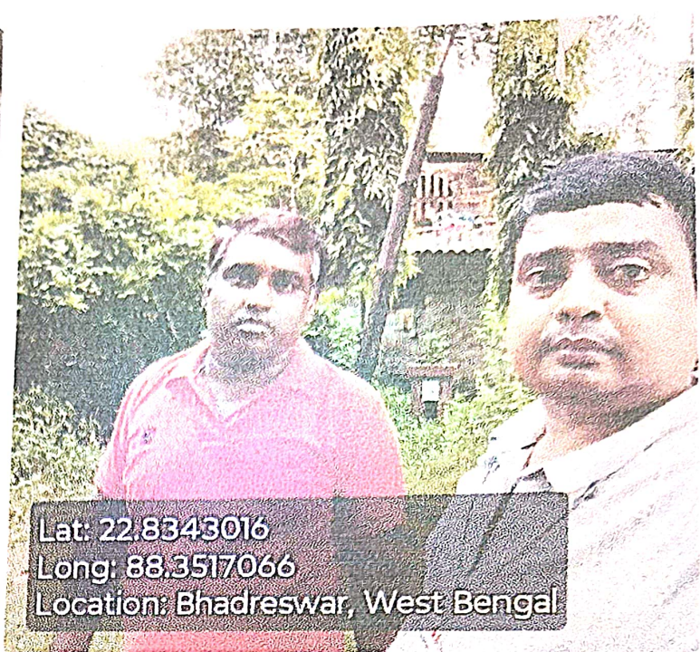
Lat: 22.8343016 Long: 88.3517066 Location: Bhadreswar, West Bengal