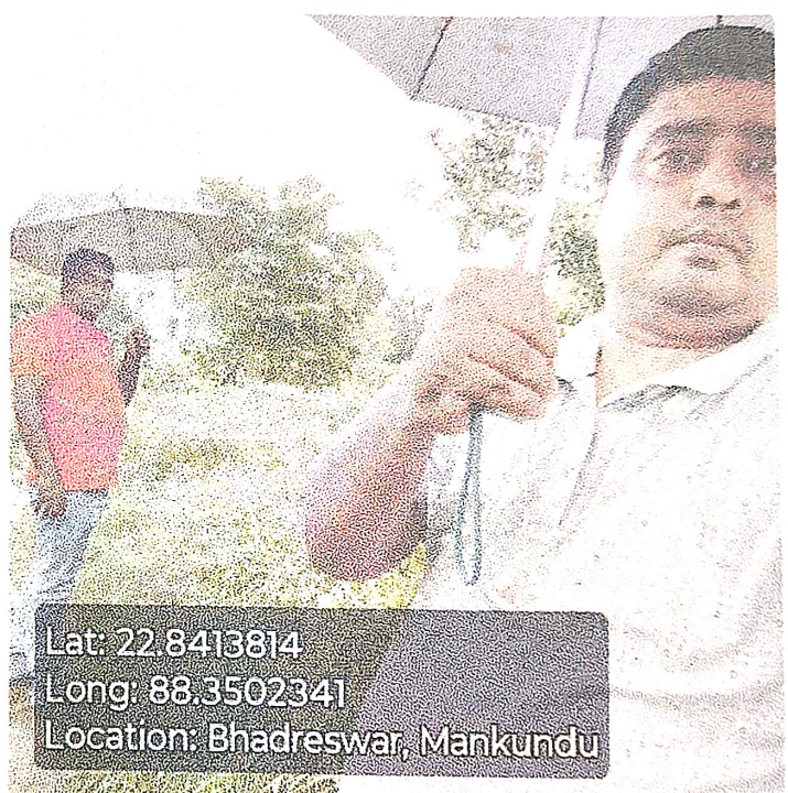
Lat: 22.8413814 Long: 88.3502341 Location: Bhadreswar, Mankundu