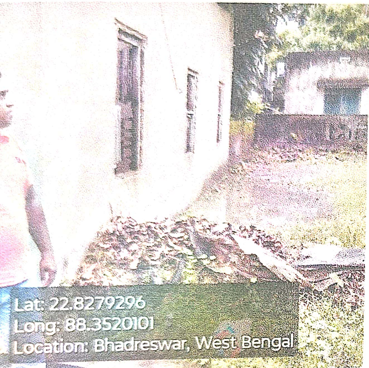
Lat: 22.8279296 Long: 88.3520101 Location: Bhadreswar, West Bengal