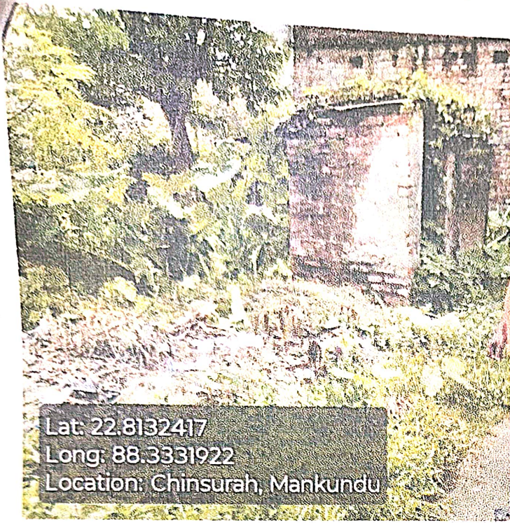
Lat: 22.8132417 Long: 88.3331922 Location: Chinsurah, Mankundu