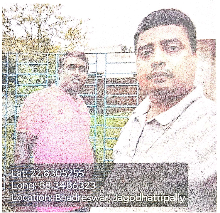
Lat: 22.8305255 Long: 88.3486323 Location: Bhadreswar, Jagodhatripally