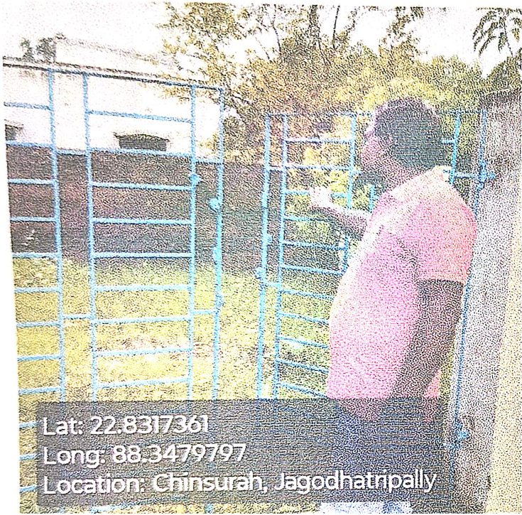
Lat: 22.8317361 Long: 88.3479797 Location: Chinsurah, Jagodhatripally