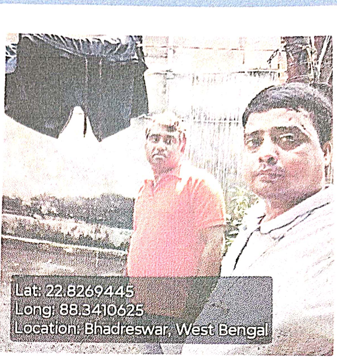
Lat: 22.8269445 Long: 88.3410625 Location: Bhadreswar, West Bengal