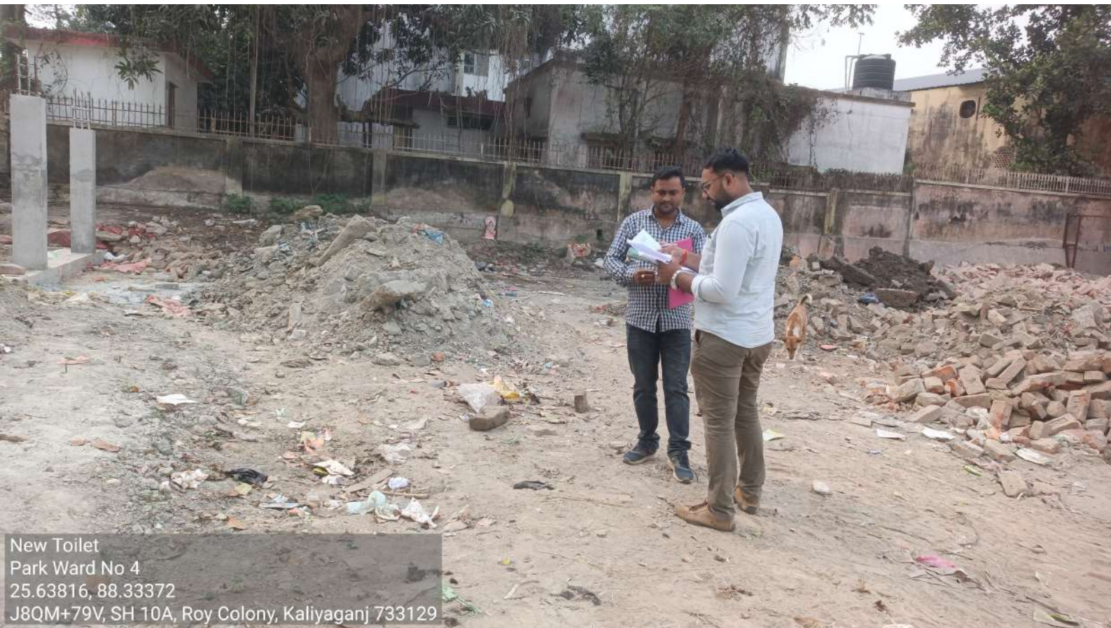
New Toilet Park Ward No 4 25.63816, 88.33372 J8QM+79V, SH 10A, Roy Colony, Kaliyaganj 733129