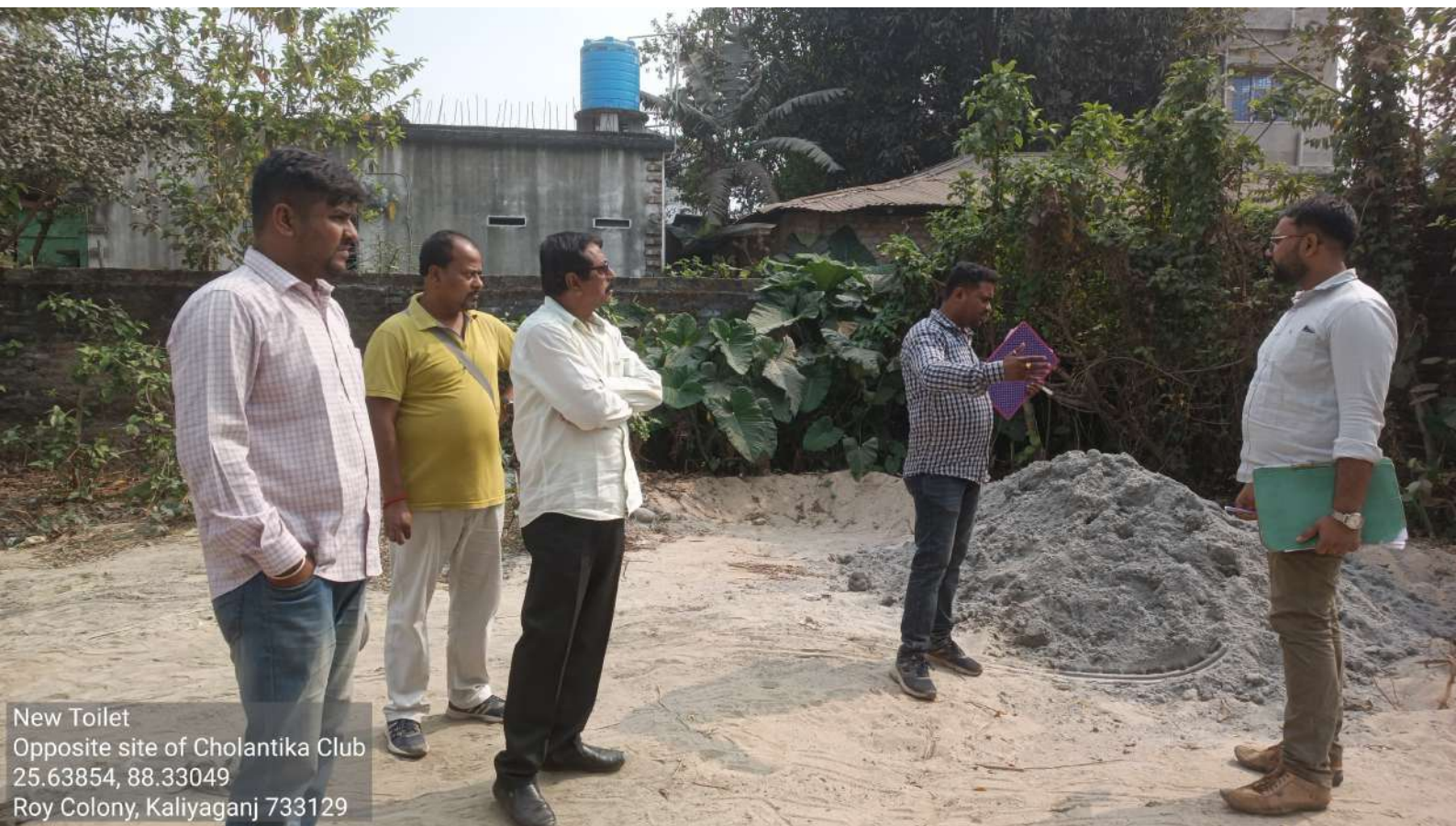
New Toilet Opposite site of Cholantika Club 25.63854, 88.33049 Roy Colony, Kaliyaganj 733129