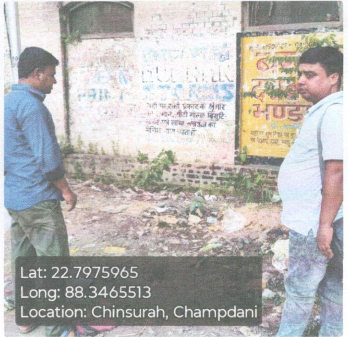
Lat: 22.7975965 Long: 88.3465513 Location: Chinsurah, Champdani