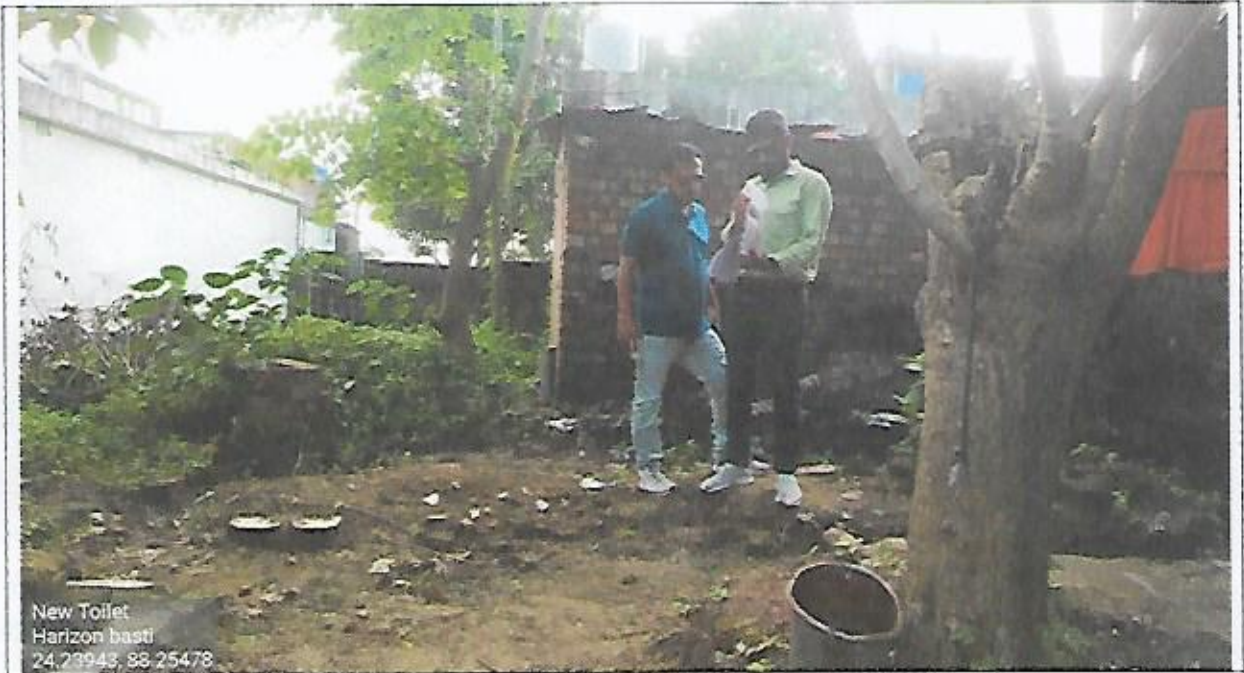
New Toilet Harizon basti 24.23943, 88.25478