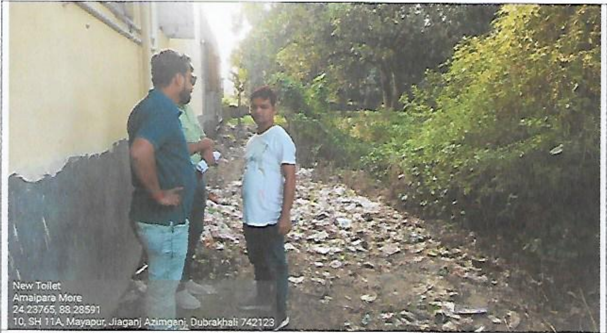
New Toilet Amaipara More 24.23765, 88.28591 10, SH 11A, Mayapur, Jiaganj Azimganj, Dubrahalhi 742123