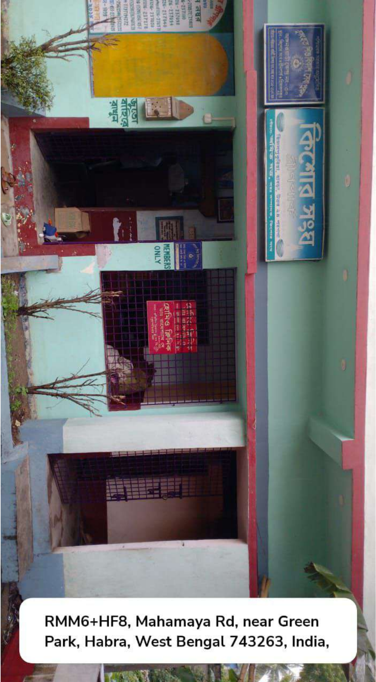
RMM6+HF8, Mahamaya Rd, near Green Park, Habra, West Bengal 743263, India,