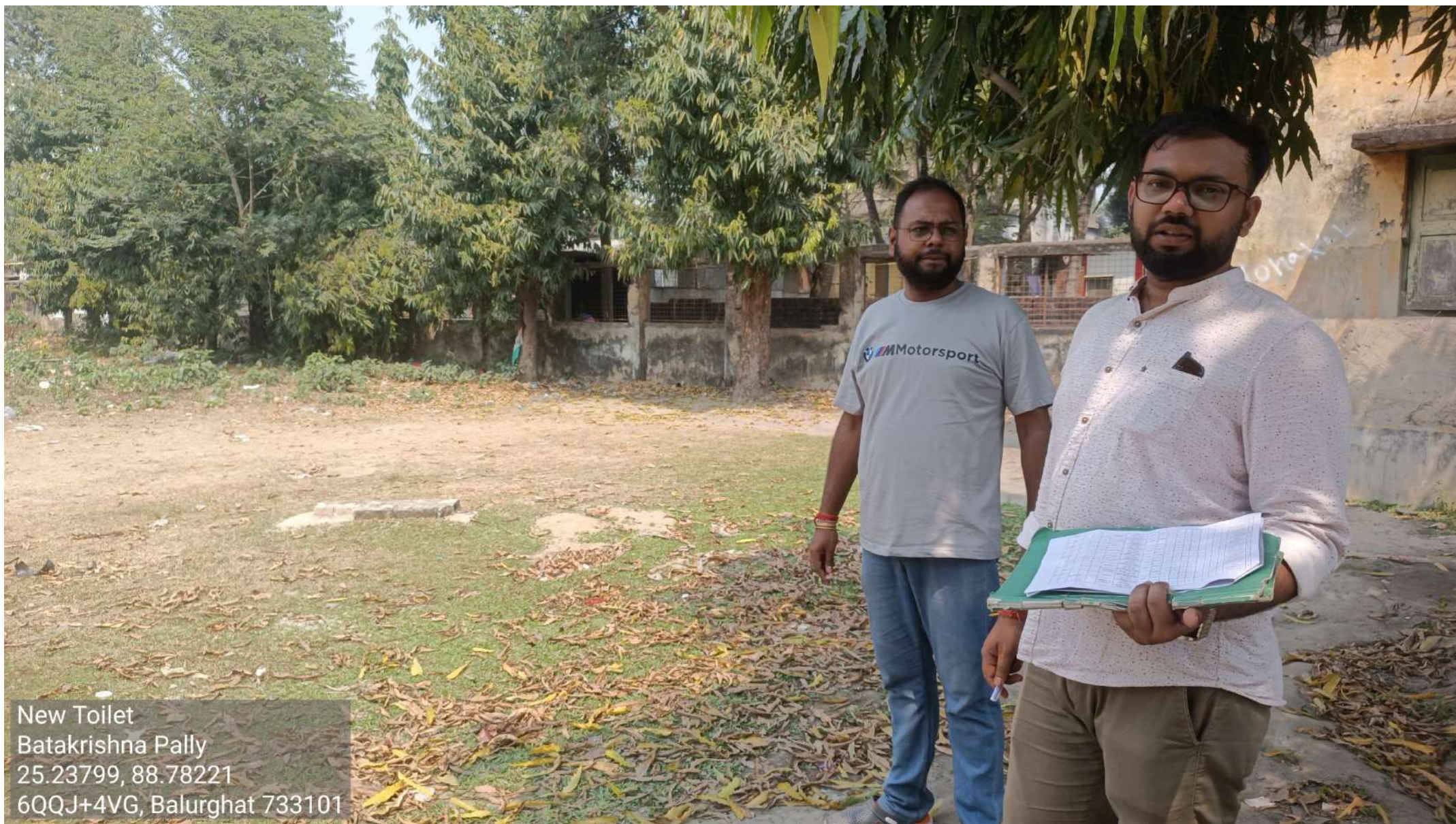
New Toilet Batakrisna Pally 25.23799, 88.78221 6QQJ+4VG, Balurghat 733101