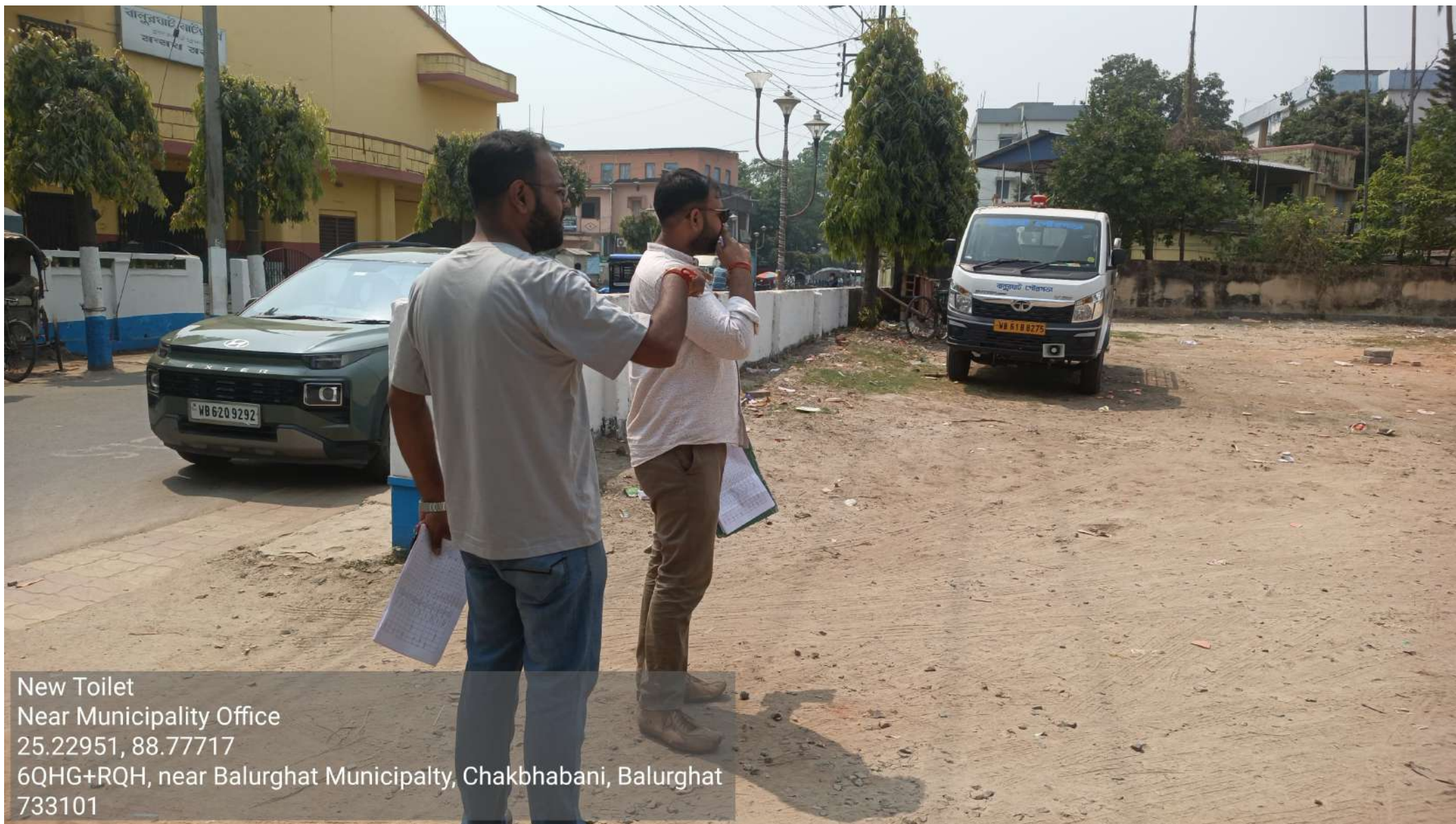
New Toilet Near Municipality Office 25.22951, 88.77717 6QHG+RQH, near Balurghat Municipalty, Chakbhabani, Balurghat 733101