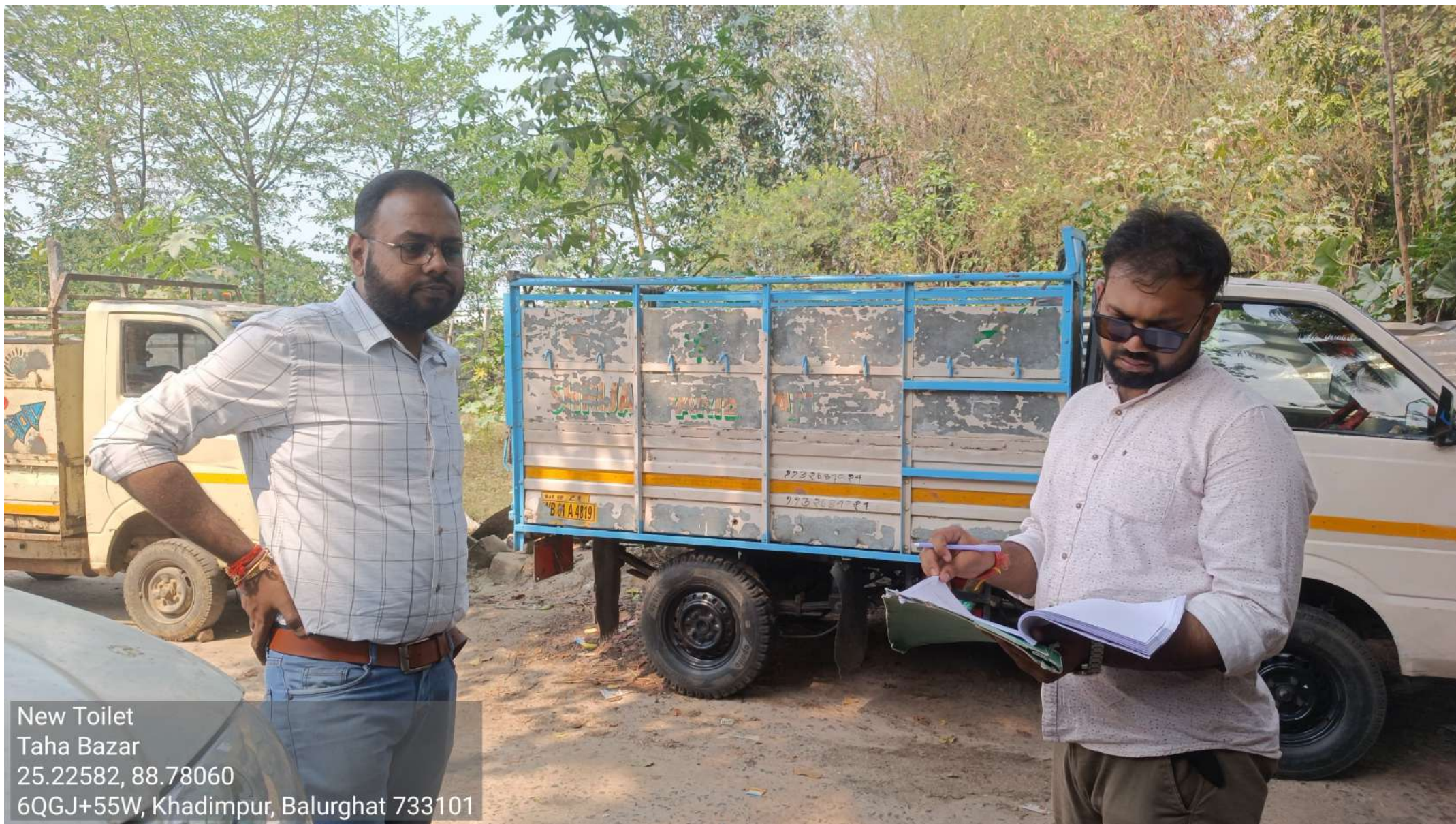
New Toilet Taha Bazar 25.22582, 88.78060 6QGJ+55W, Khadimpur, Balurghat 733101