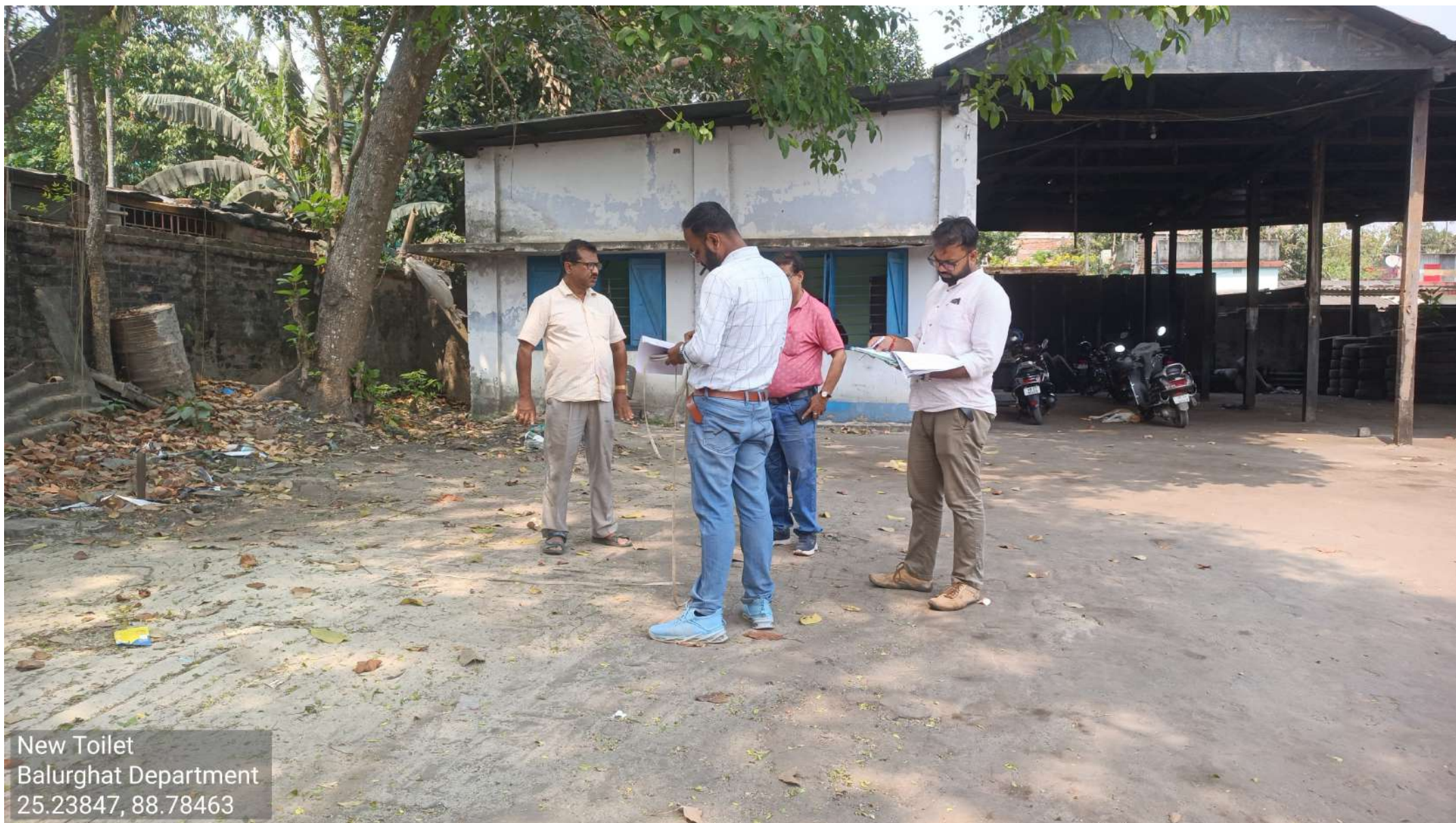
New Toilet Balurghat Department 25.23847, 88.78463