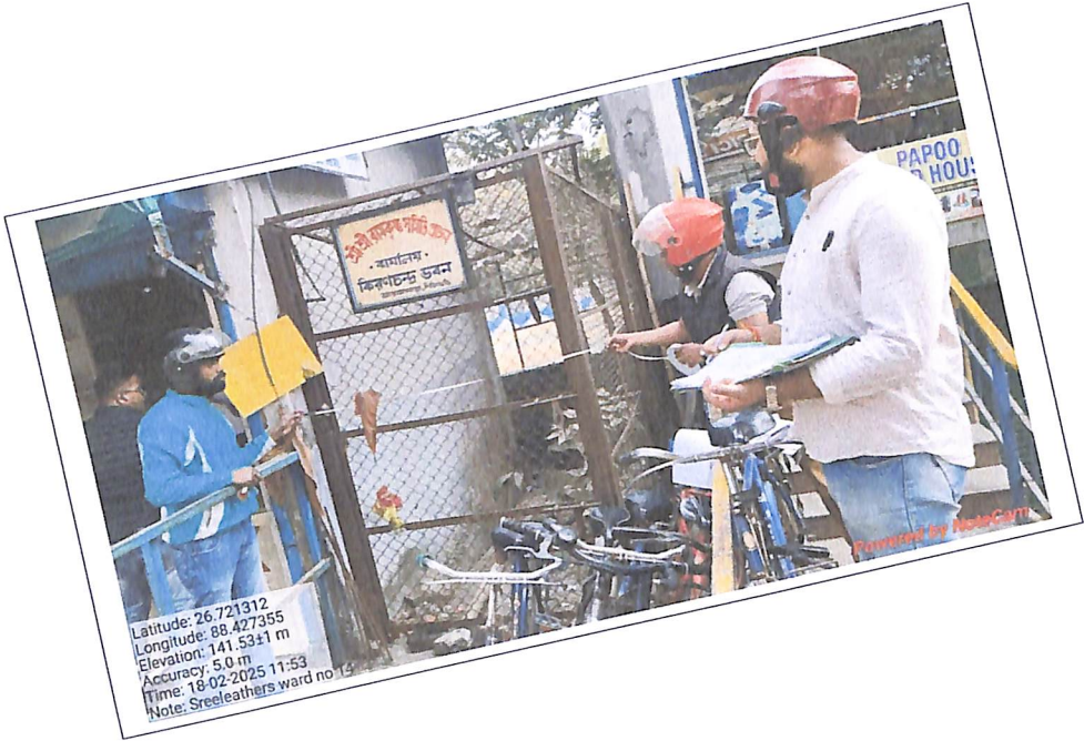
Construction of Public Toilet Near Srileathers, Ward No-14