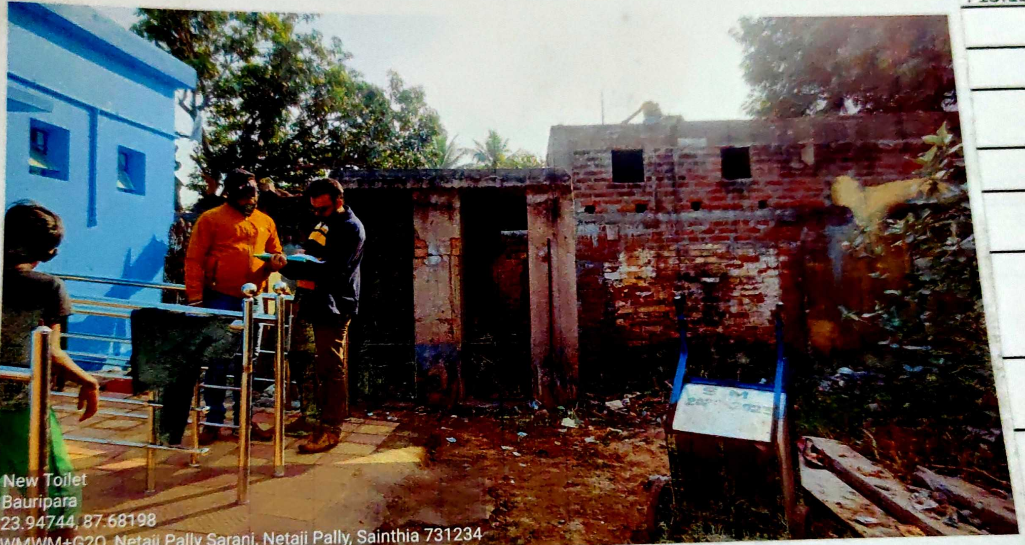
New Toilet Bauripara 23.94744, 87.68198 WMWM+G2Q, Netaji Pally Sarani, Netaji Pally, Sainthia 731234