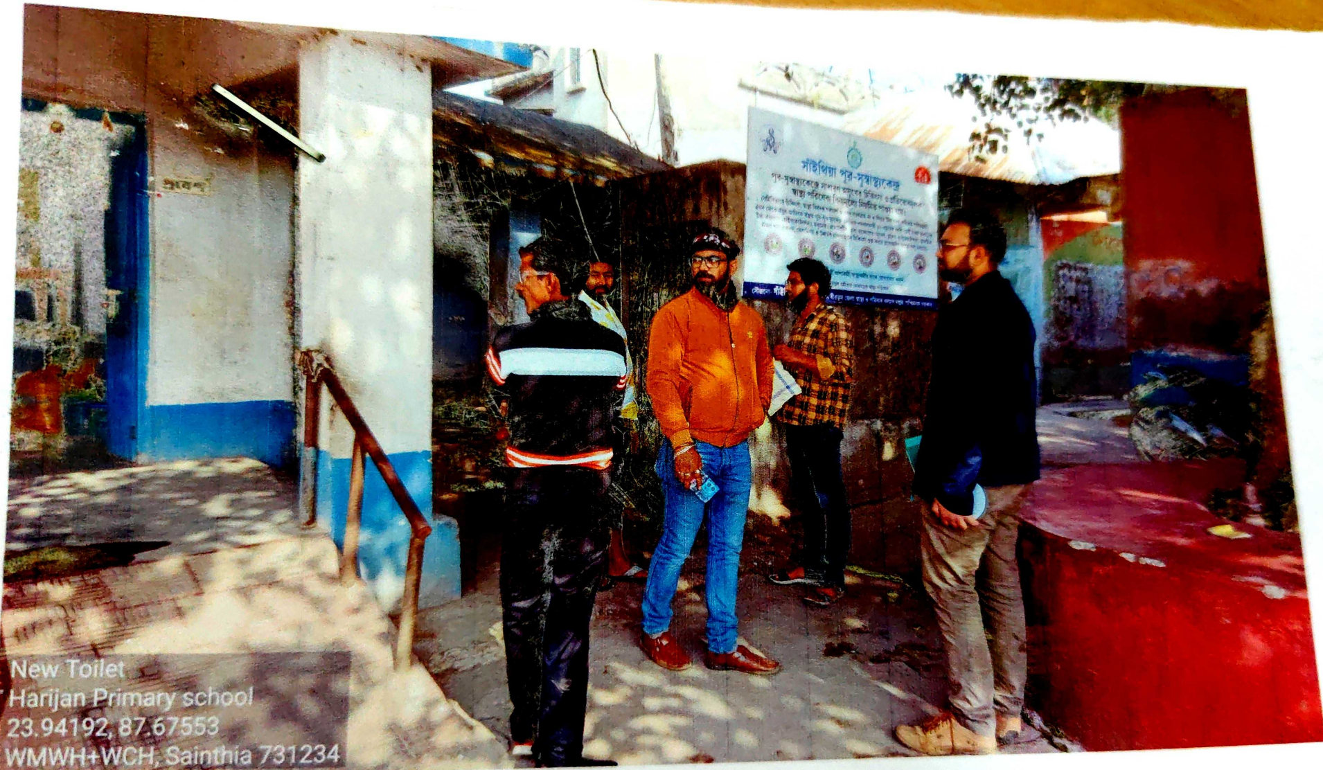
New Toilet Harijan Primary school 23.94192, 87.67553 WMWH+WCH, Sainthia 731234