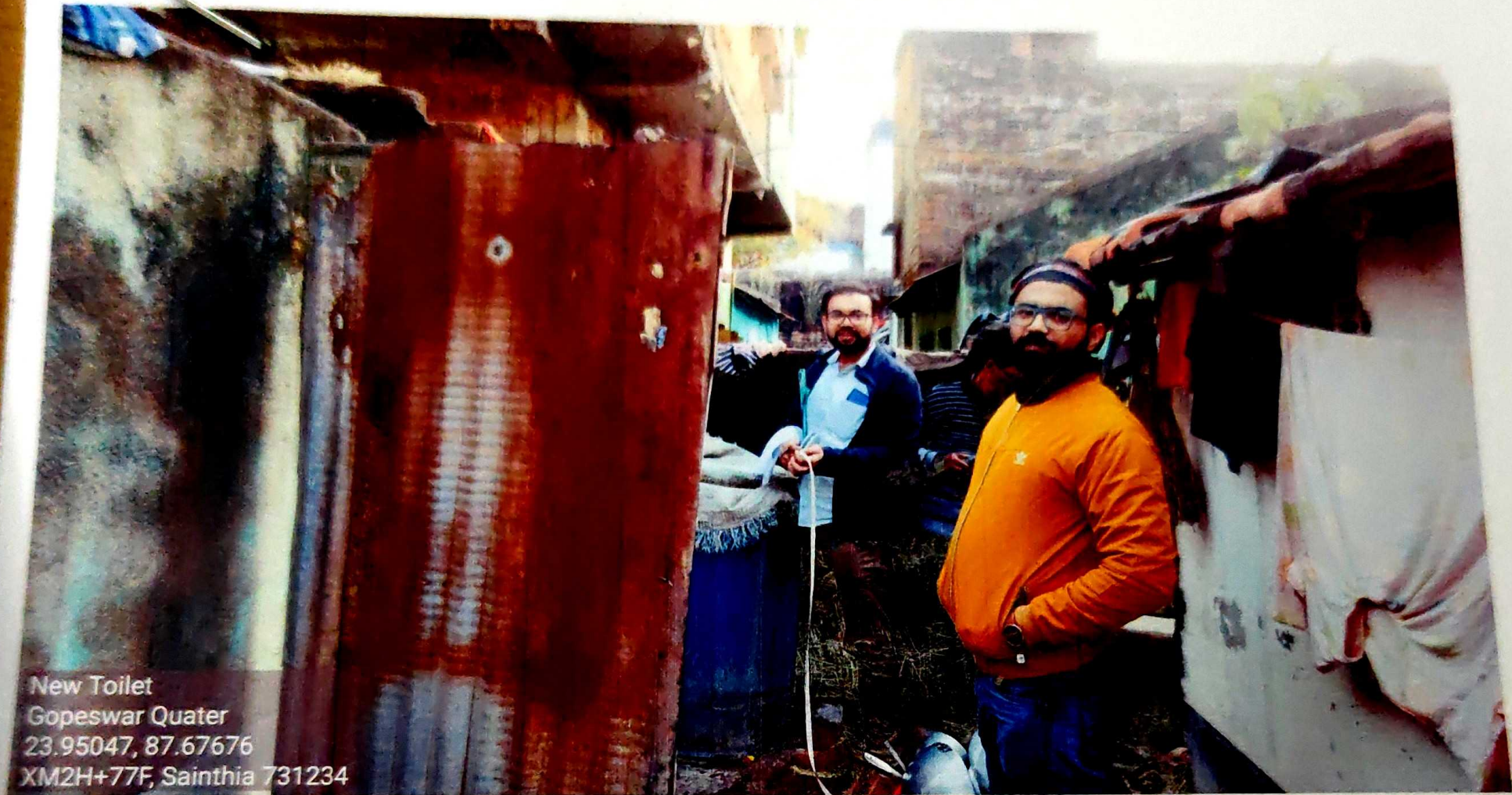
New Toilet Gopeswar Quater 23.95047, 87.67676 XM2H+77F, Sainthia 731234