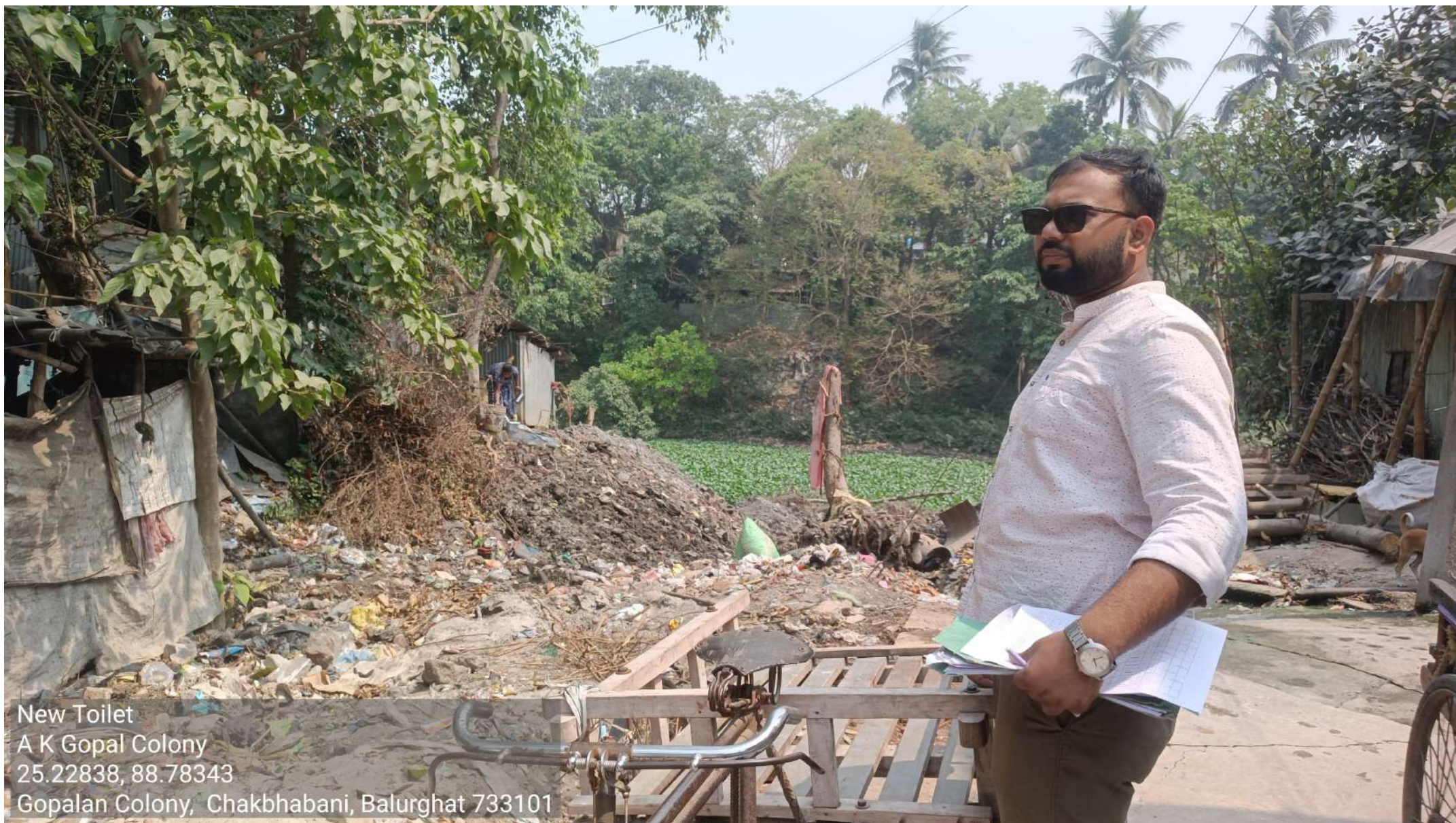
New Toilet A K Gopal Colony 25.22838, 88.78343 Gopalan Colony, Chakbhabani, Balurghat 733101