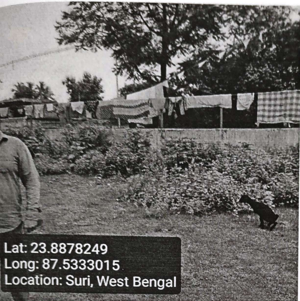
Lat: 23.8878249 Long: 87.5333015 Location: Suri, West Bengal