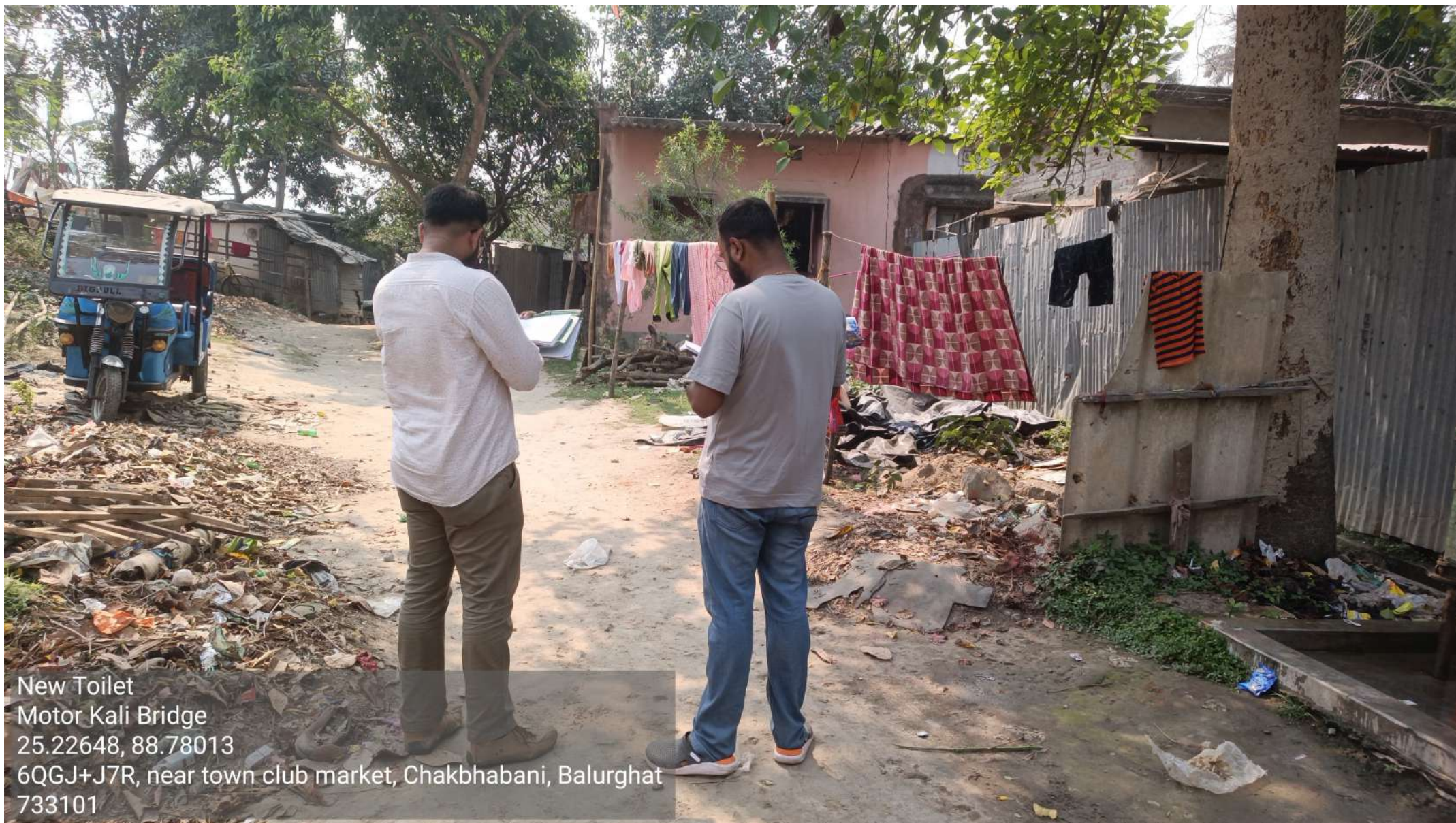
New Toilet Motor Kali Bridge 25.22648, 88.78013 6QGJ+J7R, near town club market, Chakbhabani, Balurghat 733101