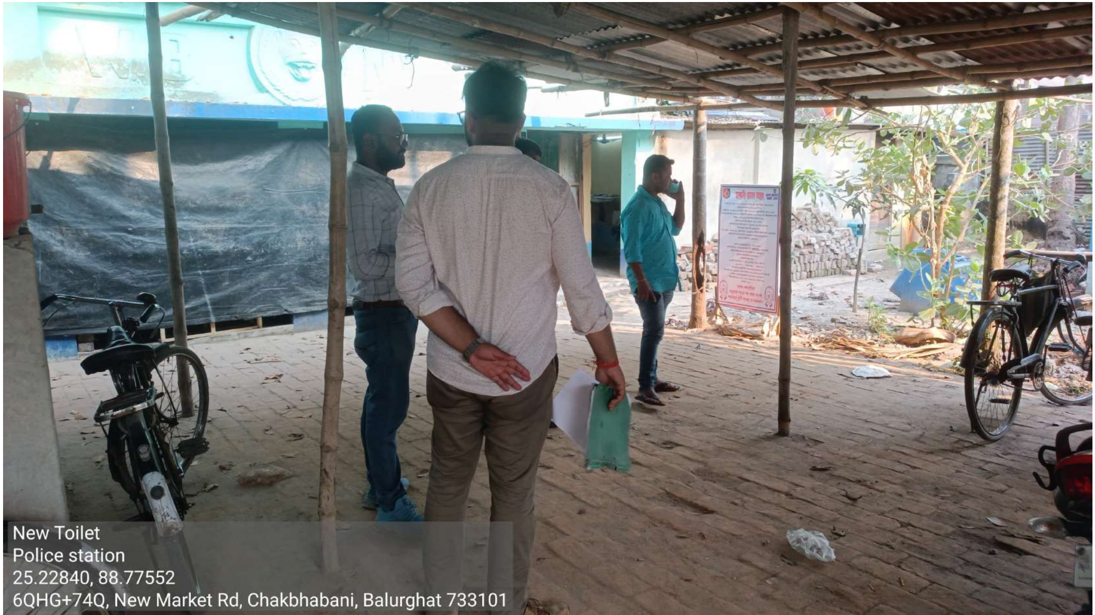
New Toilet Police station 25.22840, 88.77552 6QHG+74Q, New Market Rd, Chakbhabani, Balurghat 733101