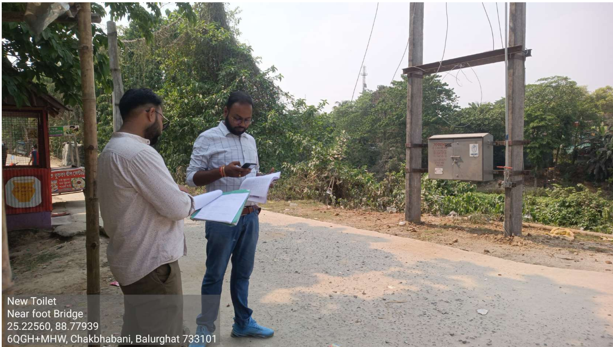
New Toilet Near foot Bridge 25.22560, 88.77939 6QGH+MHW, Chakbhabani, Balurghat 733101