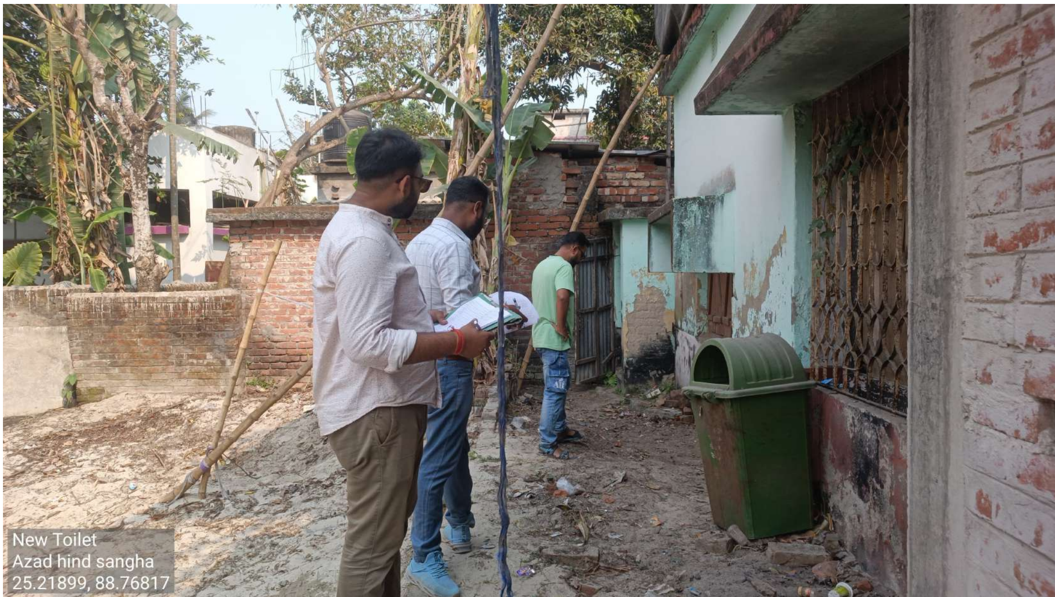
New Toilet Azad hind sangha 25.21899, 88.76817