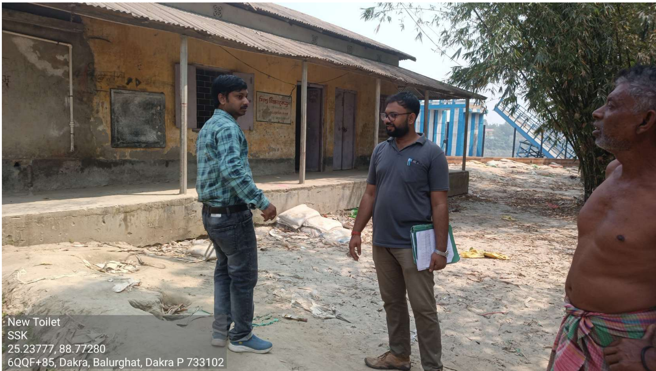
New Toilet SSK 25.23777, 88.77280 6QQF+85, Dakra, Balurghat, Dakra P 733102