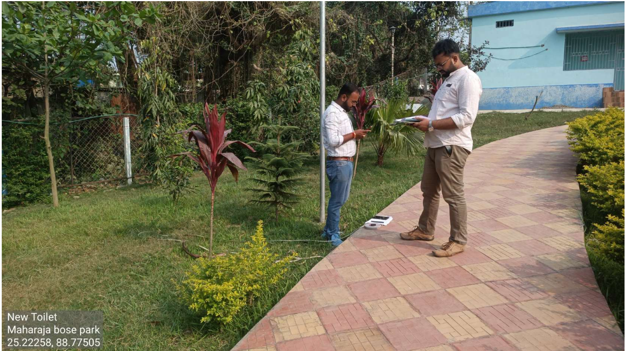
New Toilet Maharaja bose park 25.22258, 88.77505