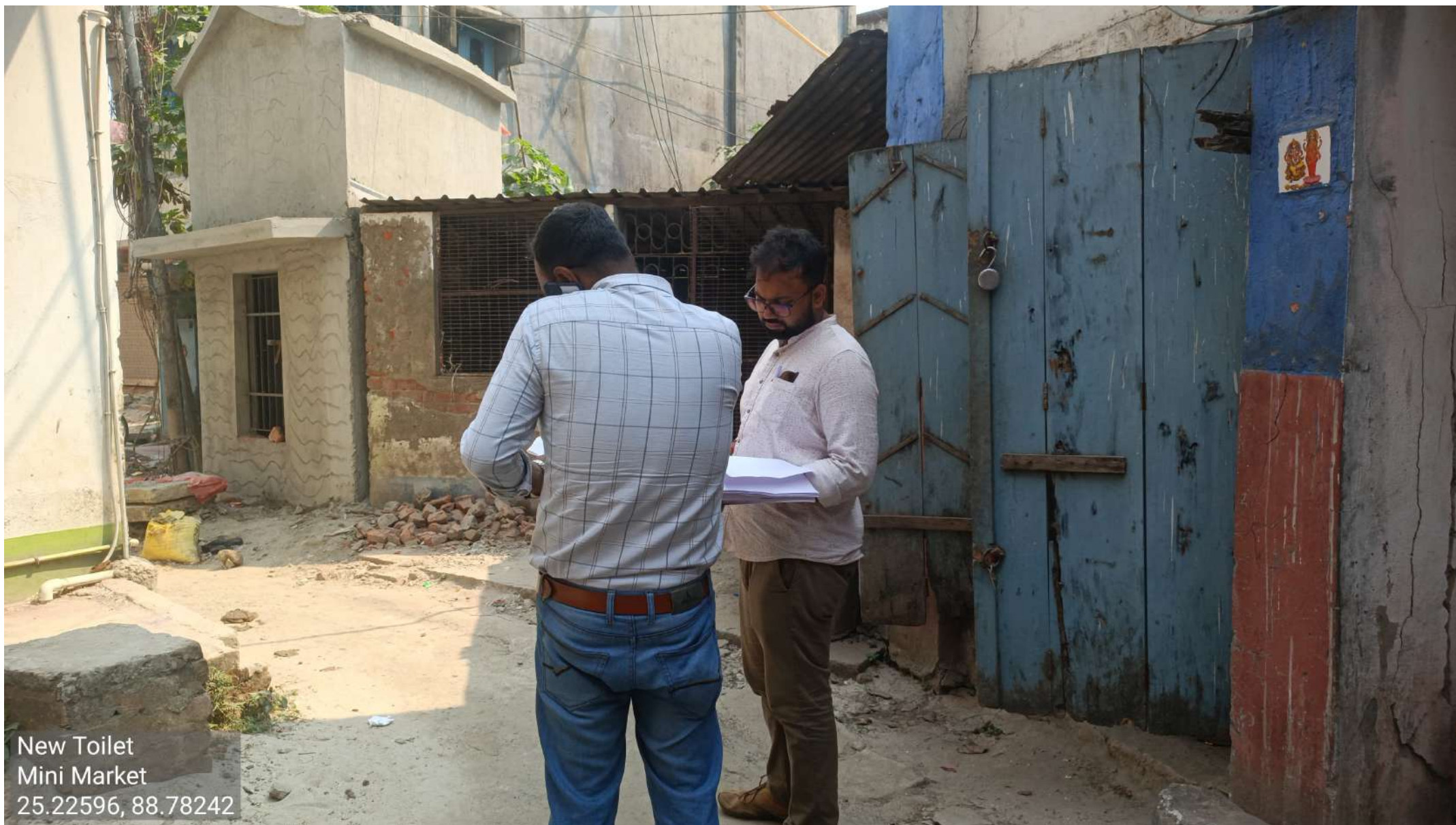
New Toilet Mini Market 25.22596, 88.78242