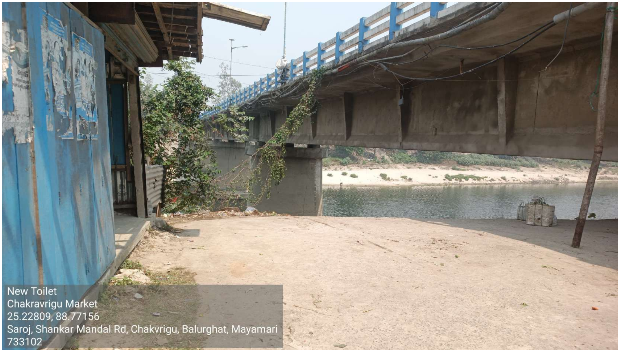
New Toilet Chakravrigu Market 25.22809, 88.77156 Saroj, Shankar Mandal Rd, Chakvrigu, Balurghat, Mayamari 733102