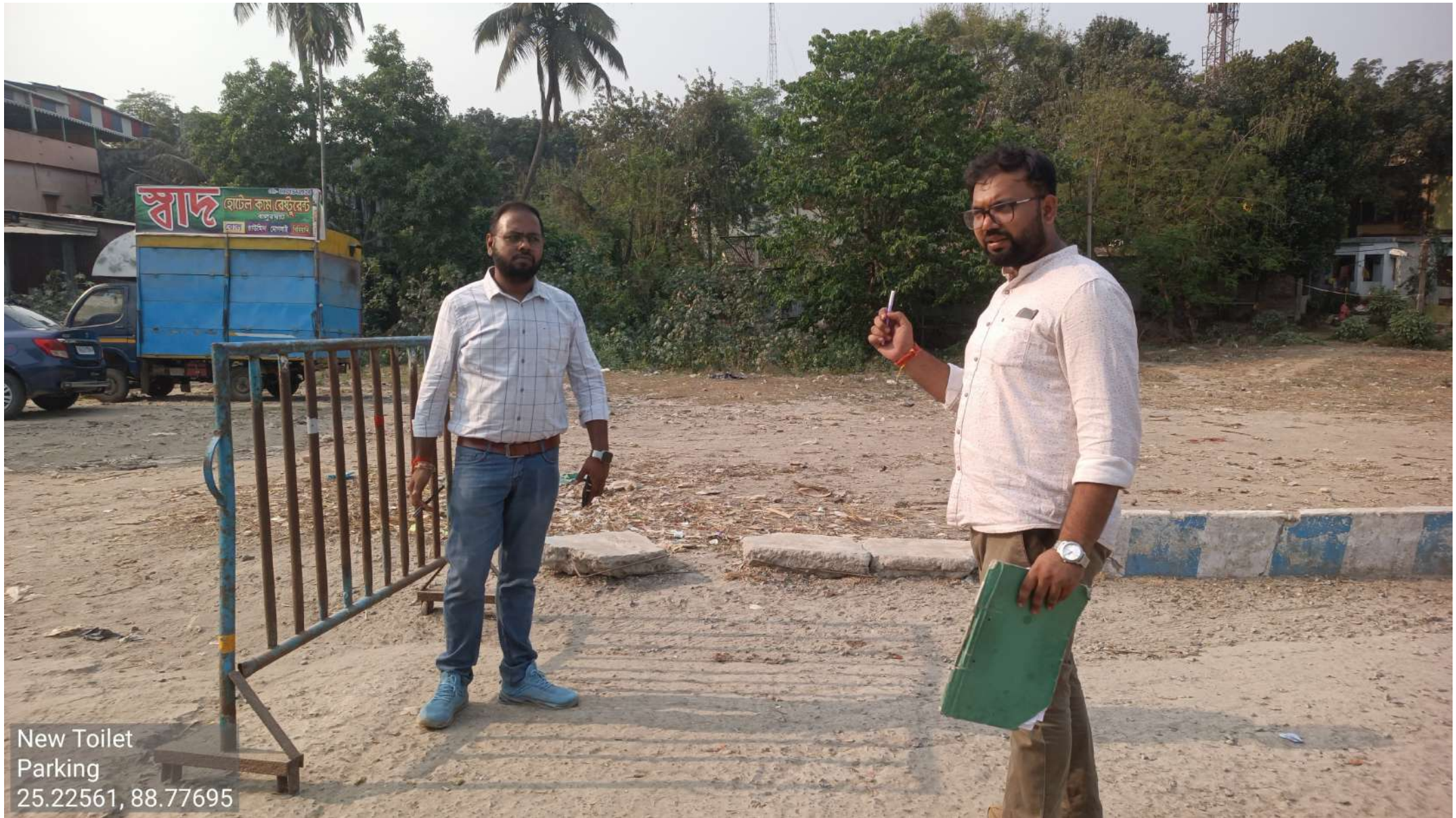
New Toilet Parking 25.22561, 88.77695