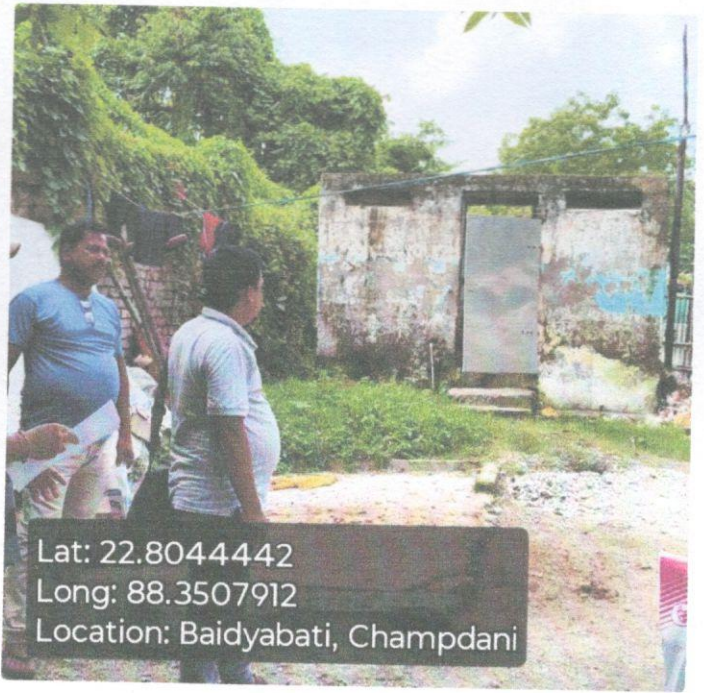
Lat: 22.8044442 Long: 88.3507912 Location: Baidyabati, Champdani