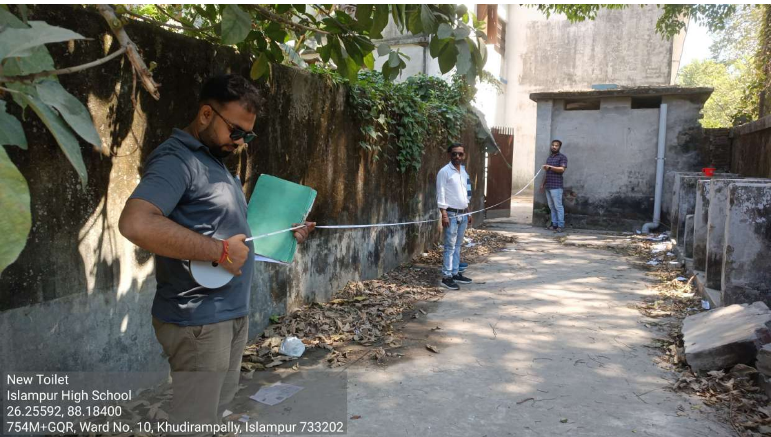
New Toilet Islampur High School 26.25592, 88.18400 754M+GQR, Ward No. 10, Khudirampally, Islampur 733202