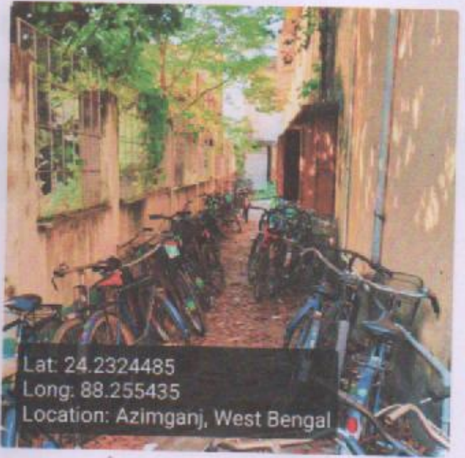
Lat: 24.2324485 Long: 88.255435 Location: Azimganj, West Bengal