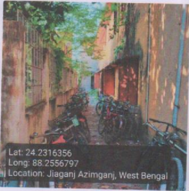
Lat: 24.2316356 Long: 88.2556797 Location: Jiaganj Azimganj, West Bengal