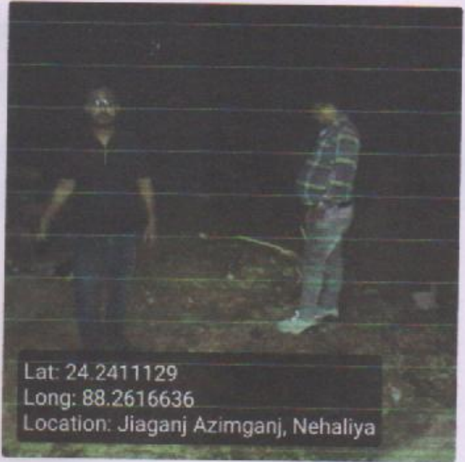
Lat: 24.2411129 Long: 88.2616636 Location: Jiaganj Azimganj, Nehaliya