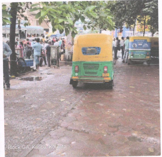
Block GA, Kasba, Kolkata