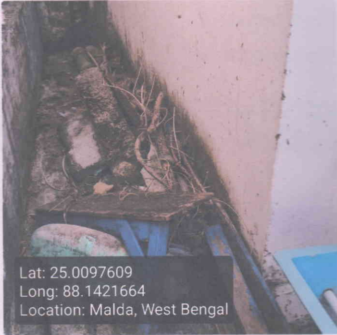
Lat: 25.0097609 Long: 88.1421664 Location: Malda, West Bengal